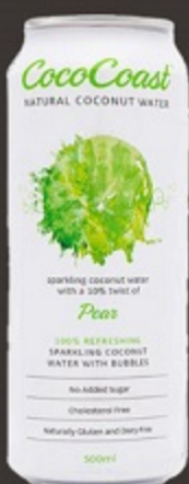
500ML COCOCOAST SPARKLING PEAR CARTON QUANTITY: 24