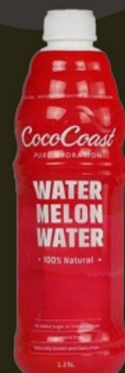
1.25L COCOCOAST WATERMELON CARTON QUANTITY: 12