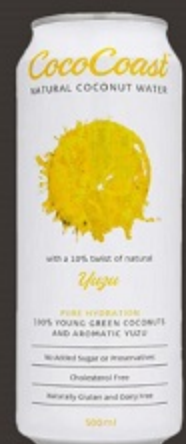
500ML COCOCOAST YUZU C/W CAN CARTON QUANTITY: 24