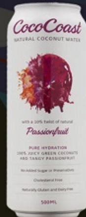
500ML COCOCOAST PASSIONFRUIT COCONUT WATER CARTON QUANTITY: 24