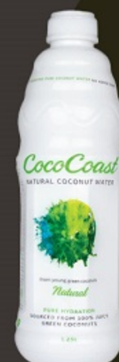
1.25L COCOCOAST NATURAL COCONUT WATER CARTON QUANTITY: 12