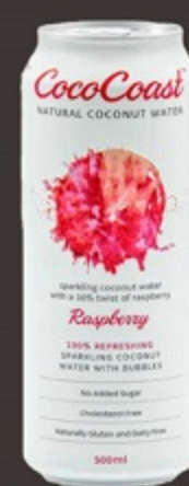
500ML COCOCOAST RASPBERRY CARTON QUANTITY: 24