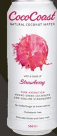
500ML COCOCOAST STRAWBERRY C/W CAN CARTON QUANTITY: 24