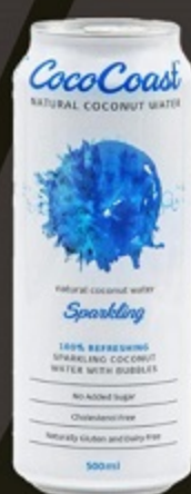
500ML COCOCOAST SPARKLING CARTON QUANTITY: 24