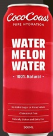
500ML COCOCOAST WATERMELON WATER CARTON QUANTITY: 24