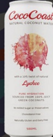
500ML COCOCOAST LYCHEE COCONUT WATER CARTON QUANTITY: 24