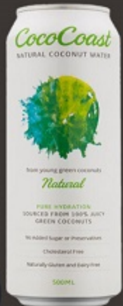
500ML COCOCOAST NATURAL COCONUT WATER CARTON QUANTITY: 24